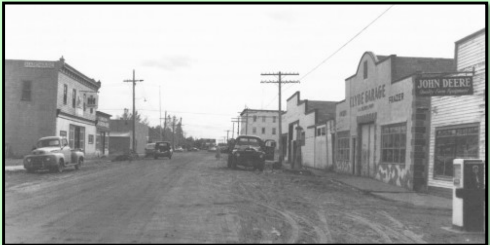
Downtown Clyde, looking South, 1957.

In 1911 -12 The Village of Clyde was sub-divided into four blocks each containing 23 lots upon which businesses and residences would be developed. In 1914 MacKenzie Mann and Company sold all available lots to Canadian Northern Town Properties Ltd. and National Trust Co. Ltd. and Clyde entered a stage of rapid growth.