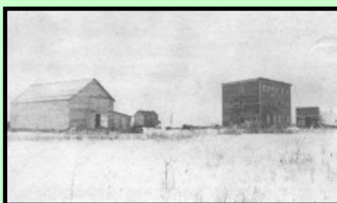
Downtown Clyde, 1911.

Interested in more of Clyde's history? This information was pulled from the book, Clyde, A Place to Call Home , which is available for purchase from the Village Office.