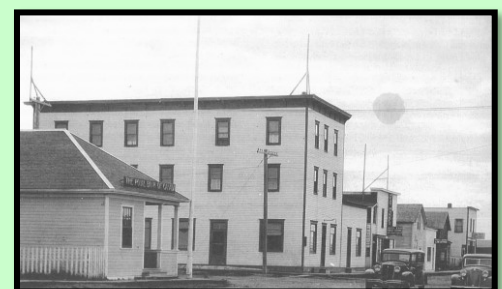
Downtown Clyde, 1920's.